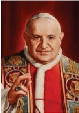
St. John the Evangelist Church 25 Library St. Hudson NH