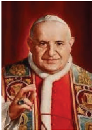
St. John the Evangelist Church 25 Library St. Hudson NH