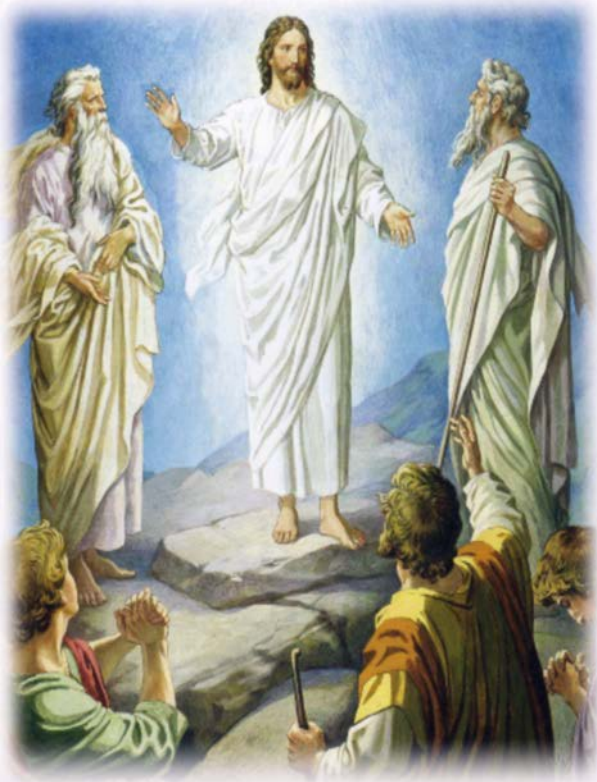
“This is my CHOSEN SON; listen to him.”