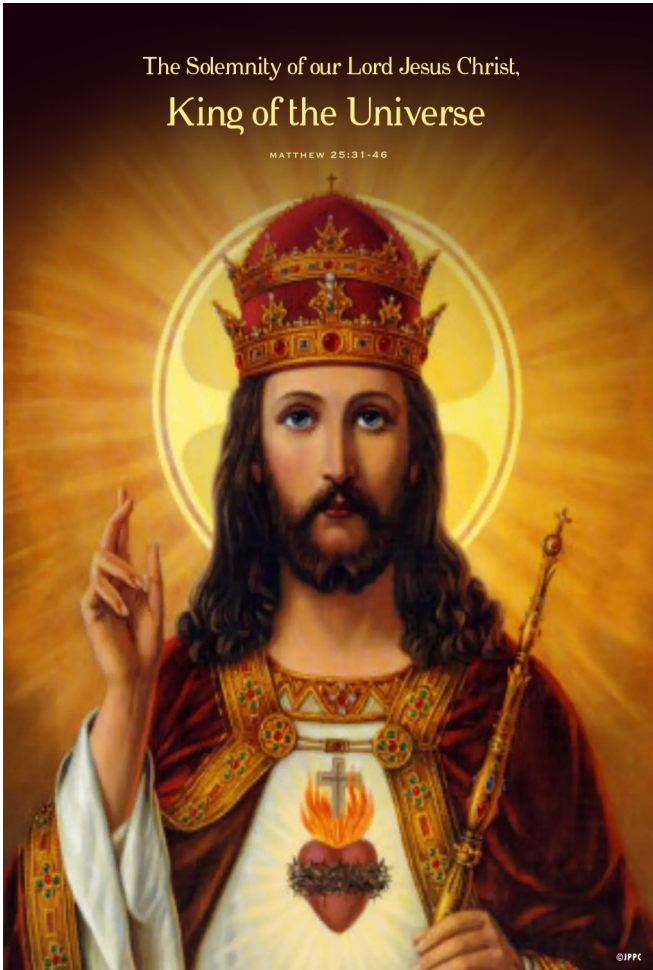
The Solemnity of our Lord Jesus Christ, King of the Universe